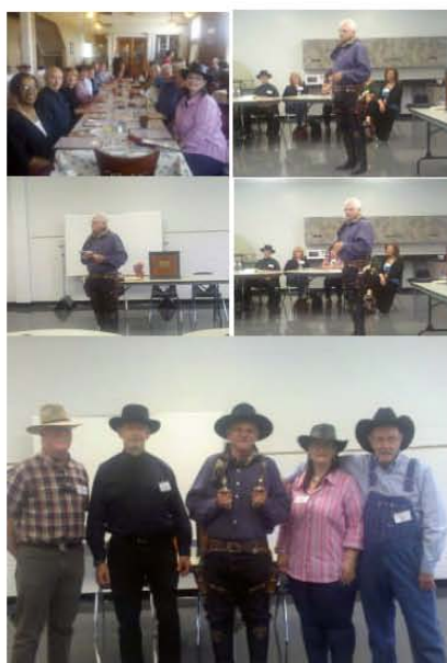
09-13-2011 Tuesday Meet at CCAC.